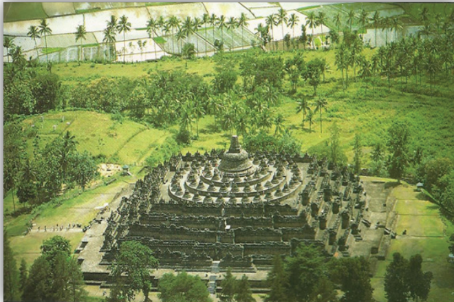
Borobudur in green environment

Known as the biggest complex of Buddhist temple in the world, and the climax of Buddhist art 2 , Borobudur monument has a huge number of reliefs on its walls reflecting the Buddha's life and Buddhism. The walls of its levels are decorated with reliefs, which are approximately 2,500 meters in length, and hundreds of Buddha statues. No doubt Borobudur temple is both forms of art and philosophy present altogether in natural setting. According to historians this temple was built by Sailendra dynasty (the ruler of mountain) of Central Java in 8th-9th century A.D. Notwithstanding, it shows how men and nature produced such high aesthetical, ethical, and ecological values of the Javanese in ancient Java immortalizing the faith and vision of the kings inspired by the Buddha. Being "a prayer in stone" 3 and landmark of Javanese art and culture its spiritual grandeur welcomes every visitor who wants to experience its beauty and magic.